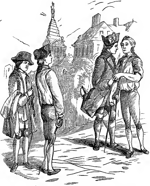
Behind Montague House.